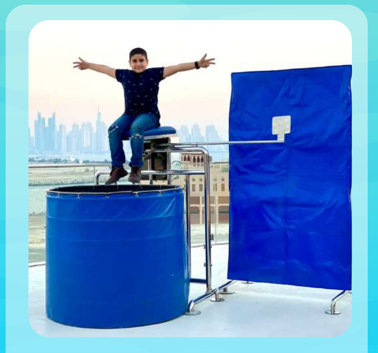
Dunk Tank Tank Size: 1.2mDiameter x 1.6mH