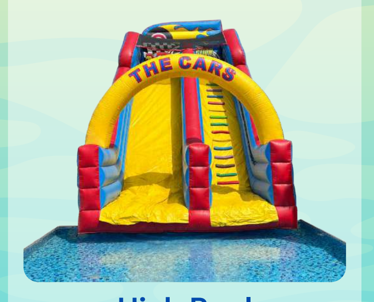
High Pool Slider Size: 9m x 5m x 8mH