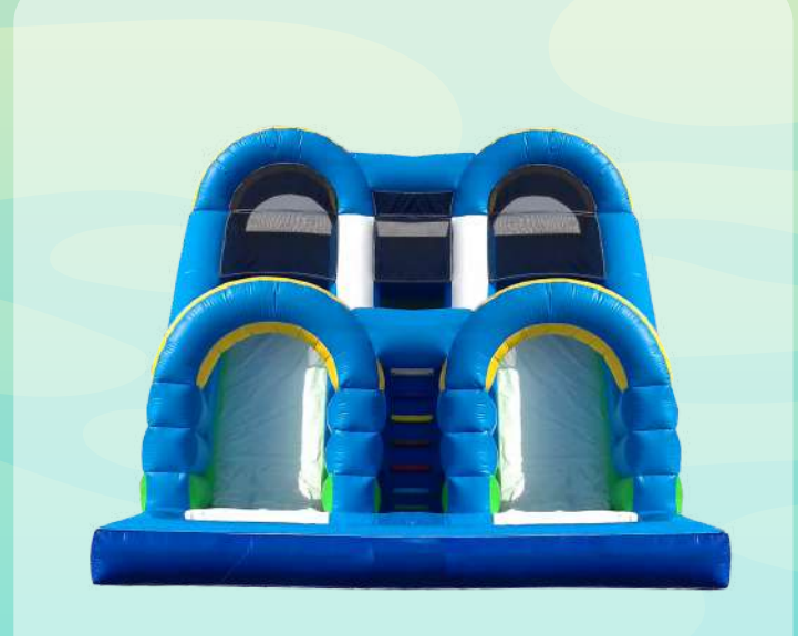
Super Wave Slider