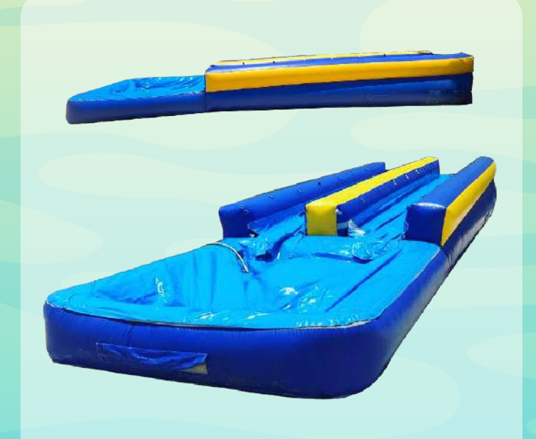
Size: 13m x 4m x 1mH