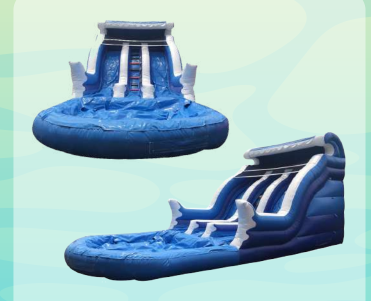
Blue Wave Slider